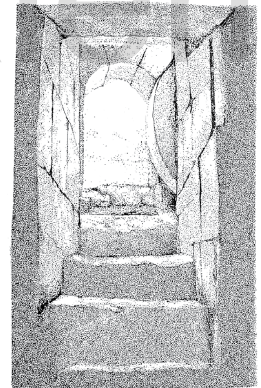
The rolling stone in Herod's family tomb, Jerusalem

The Gospels are unanimous in continuing the story of Jesus after the Crucifixion. According to Christian belief, Jesus rose from the dead on the third day after his crucifixion. The Gospels record appearances of the risen Christ in Galilee (Matthew and Mark) and in Judea, at Emmaus (possibly Mozah), Bethany, Jerusalem (John, Luke and Matthew by inference). Finally, we are told (Acts 1:2-12), he ascended to heaven from the Mount of Olives.