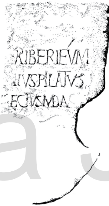
Inscription of Pontius Pilate, found at Caesarea

O Jerusalem, Jerusalem, killing the prophets and stoning those who are sent to you! (Matthew 23:37)