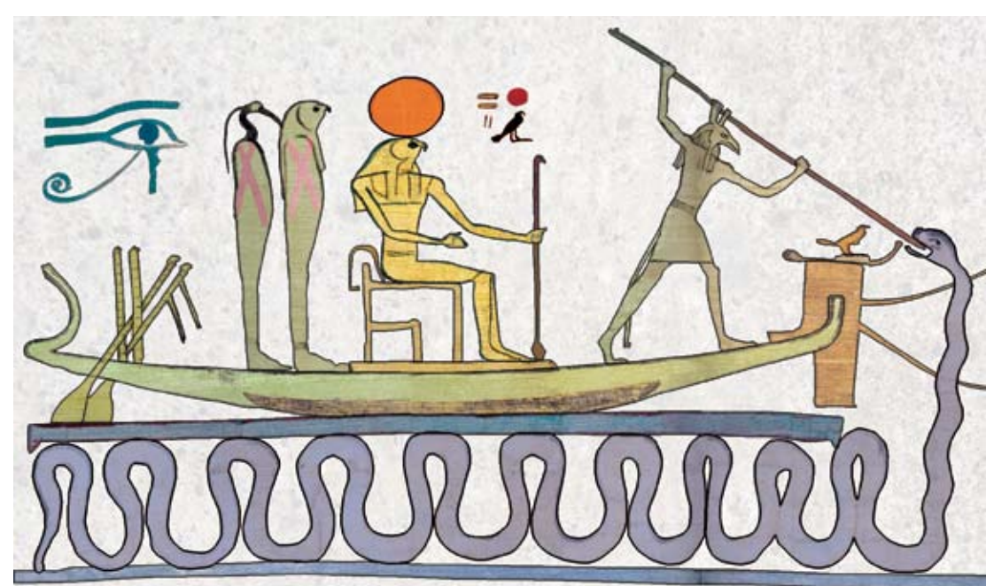
The sun god Re c traversing the underworld at night in spite of the Serpent's efforts to hinder his progress. After a papyrus from the Egyptian Museum with no index number (Schulz and Seidel 1998:448 fig.43).