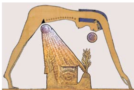
The Egyptian sky goddess Nut giving birth to the morning sun and swallowing the evening sun. Composite based on relief in the Dendara Temple (after Schulz and Seidel 1998:444 fig. 4) and Greenfield, papyrus sheet 87, British Museum EA 10554 (ibid. p.448 fig. 43).

Your descendants will also be like the dust of the earth, and you will spread out to the west and to the east and to the north and to the south.