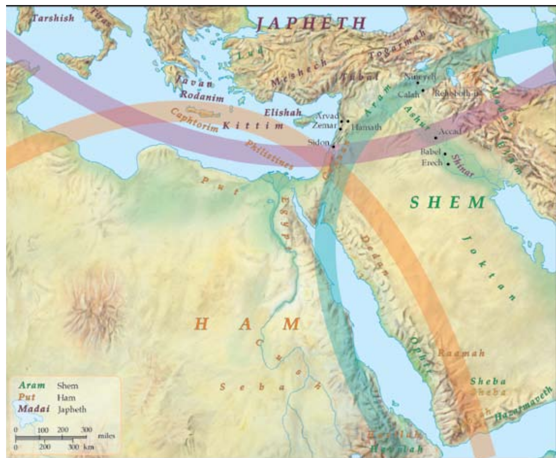
The Family of Nations.

The Cushites in this list are then linked with elements that all seem to be either in northeast Africa or on the southern "heel" of the Arabian Peninsula, viz. Seba, Havilah and Sab-